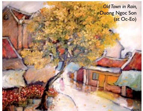
Old Town in Rain, Duong Ngoc Son (at Oc-Eo)