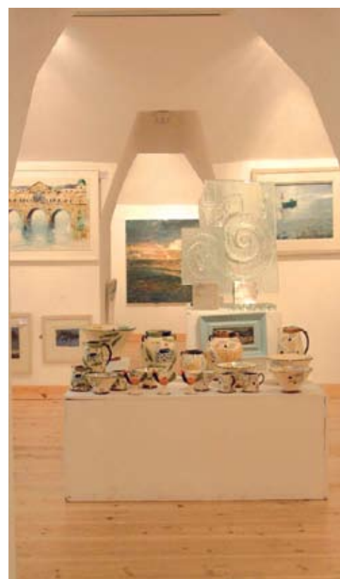
Above; distinctive jewellery at Gallery Nine; below: Shunxue Liu’s Peony Flower , Oc-Eo Gallery; right: Out of the Blue gallery, in its distinctive vaults