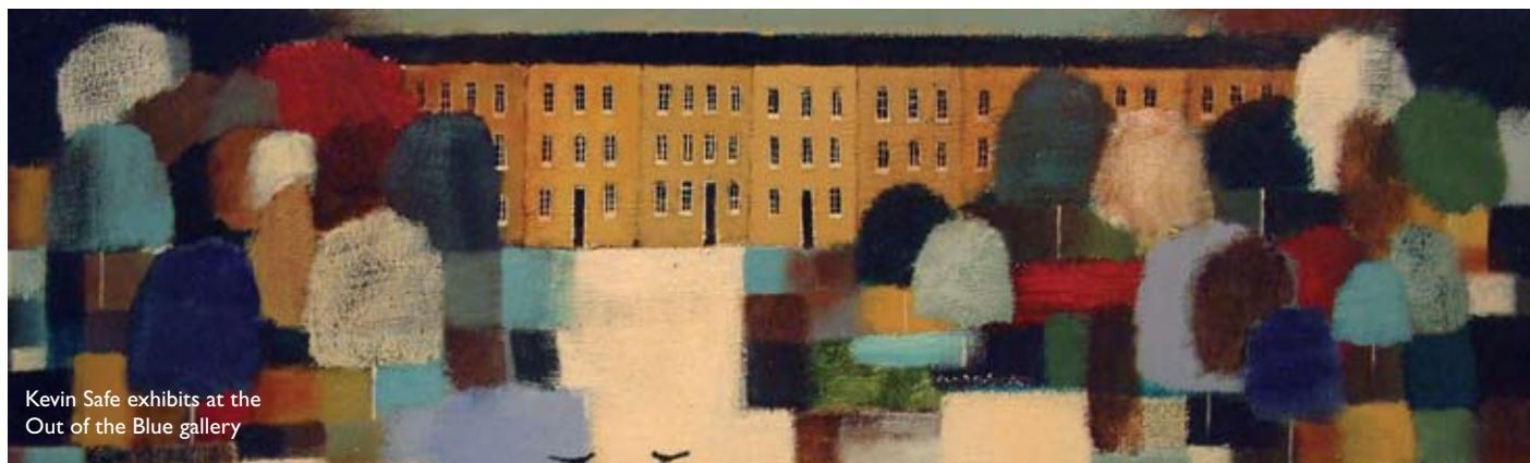
Kevin Safe exhibits at the Out of the Blue gallery

delicate, sweeping images are beautiful, authoritative and controlled. The exhibition opens on the 29th of November and continues up until 12 December.