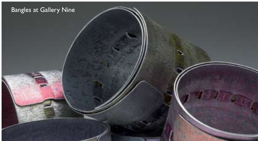
Bangles at Gallery Nine